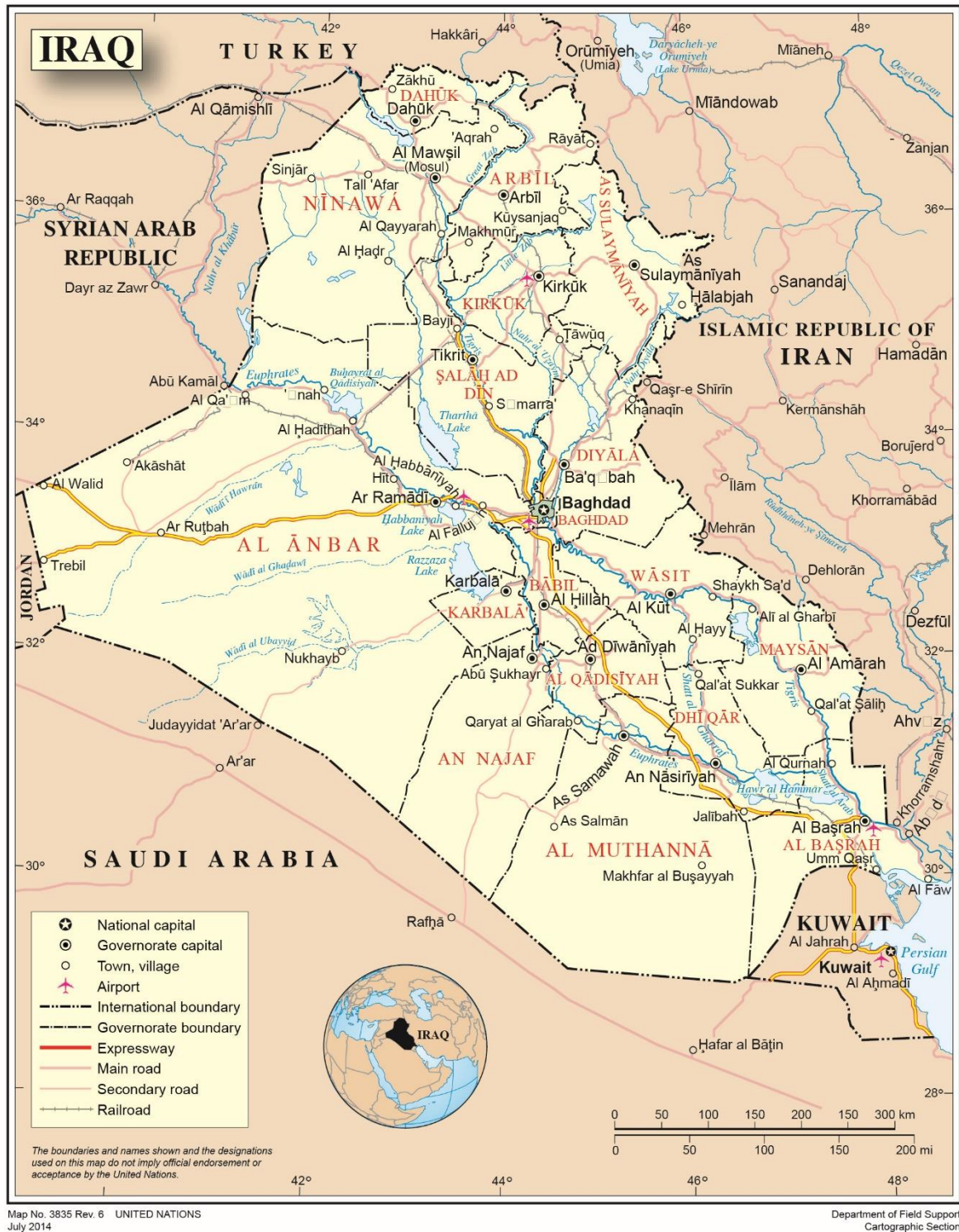
Map 1: UN, July 2014, Iraq 5